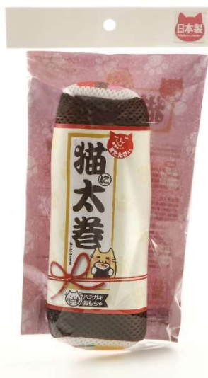
Sushi roll Size:145x60x250