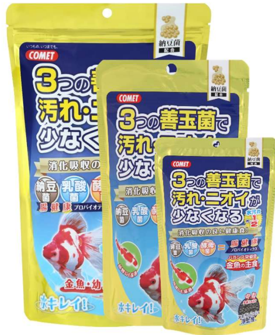
430g/200g/90g Medium size pellets