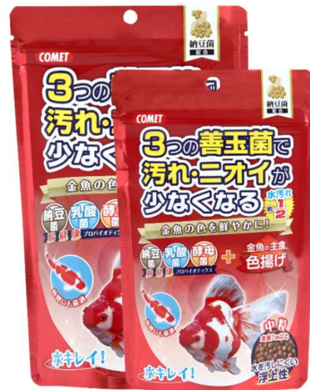
200g/90g Medium size pellets