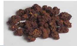
Silver Vine berry

We have been a leading maker of matatabi products in Japan since 1988.