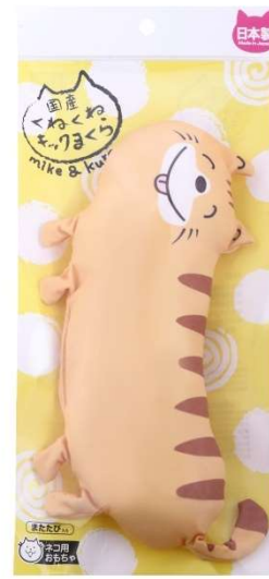
Red Tabby Cat