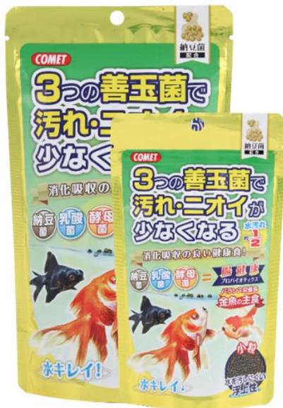
200g/90g Small size pellets