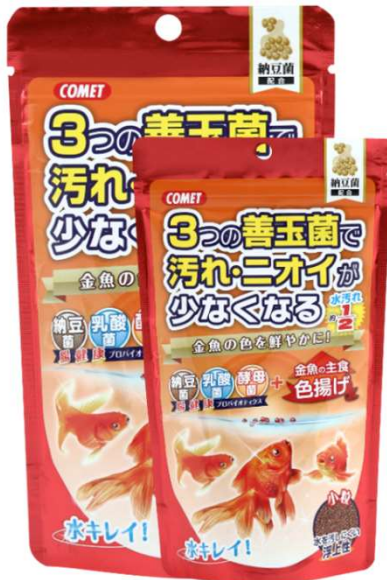
200g/90g Small size pellets