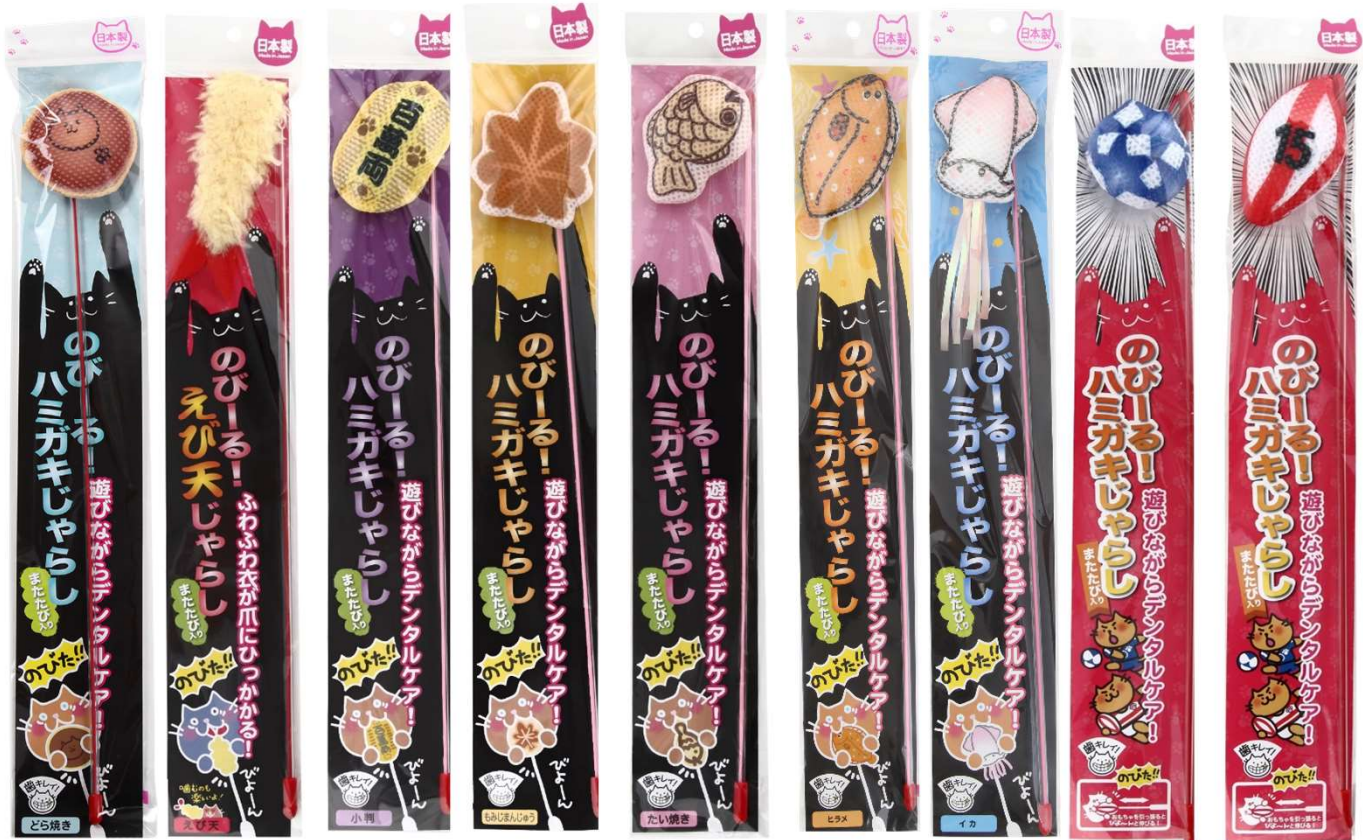
Dorayaki Shrimp Gold Autumn Taiyaki Flounder inkfish Soccer Rugby Tempura coin leaves manju Ball Ball