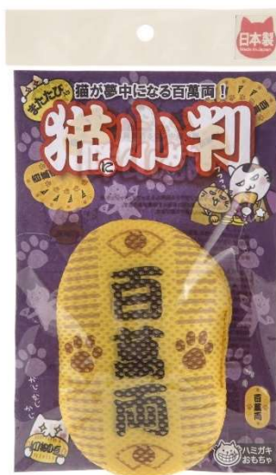
Cat Gold Coin Size:145x40x250