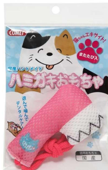
Toothbrush Size: 110x20x180